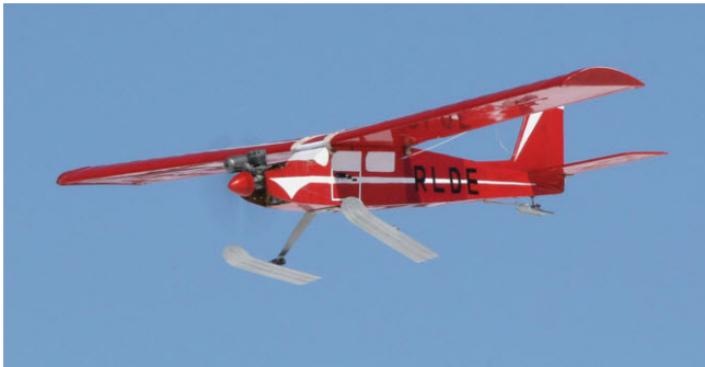
Winter flying on March 30 before the big melt turned our field into soup.