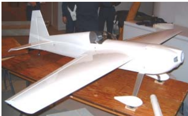
Ed Whynott's latest creation. This is an Edge 540 under construction for Jim Brown.