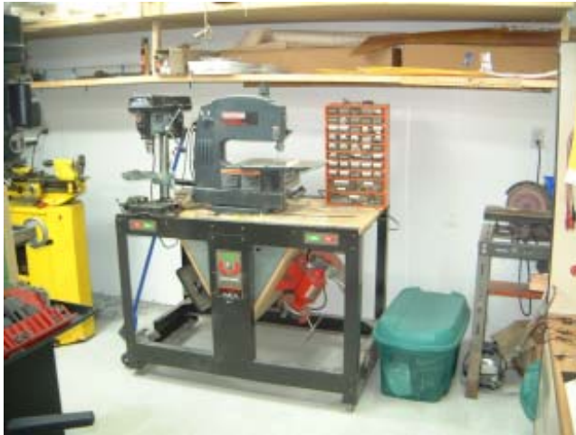
A Sears rotating tool stand allows the band saw, grinder and sander to exist on the same tool station. Getting the band saw to fit required some minor mods to the frame...