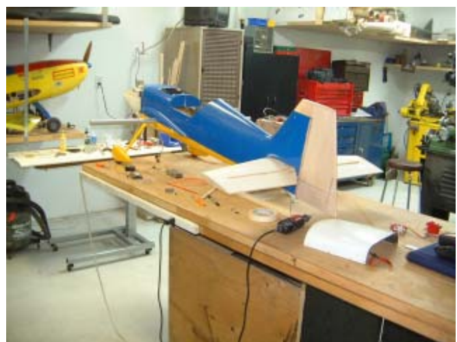
Another view of the construction table.

The workshop is heated by an oil furnace. Running the powerful fan model helps circulate the air when using paints and glues that need ventilation.