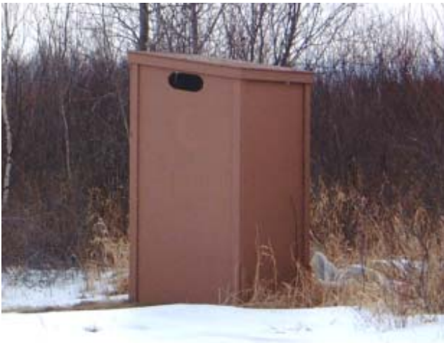
Not to be outdone, Daryl Niekamp (above) claims a different first for 2003! Prize to be determined by committee at the next monthly meeting.