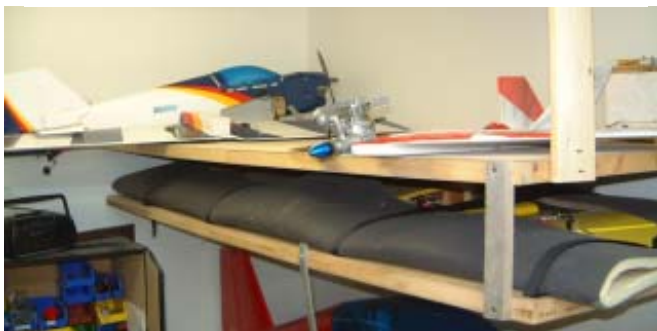
Door panels suspended from the ceiling hold planes.