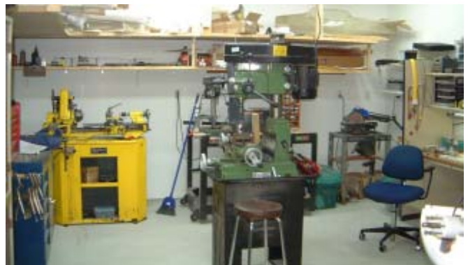
A view of the machine shop part of the room.