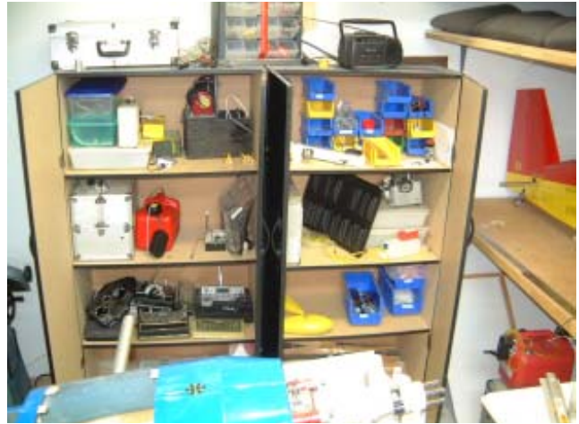
A peek into some of the cabinets around the shop show good use of storage containers to organize the bits and pieces.