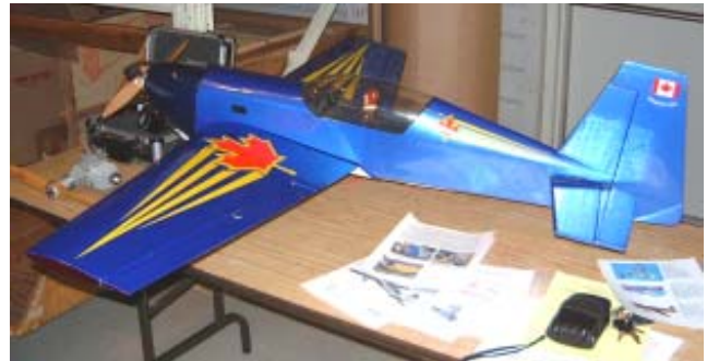
Raphael Ready was showing off the eye-catching trim job on his plane.