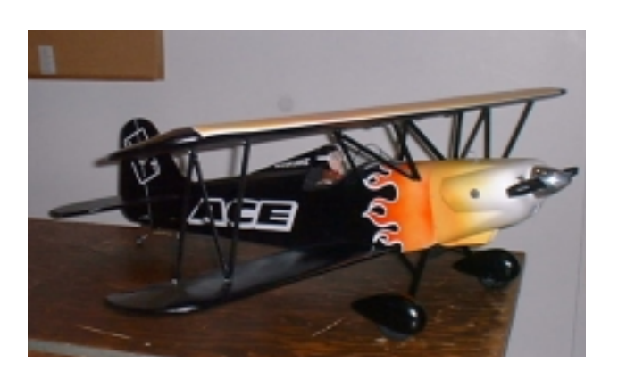
Smith Mini-Plane built by Bryan Larue was shown at the last meeting - OS 46 SF with 5 channels. Beautiful example of what vinyl graphics can look like!

9 to 9 M—F 9 to 5 Saturday 11 to 5 Sunday