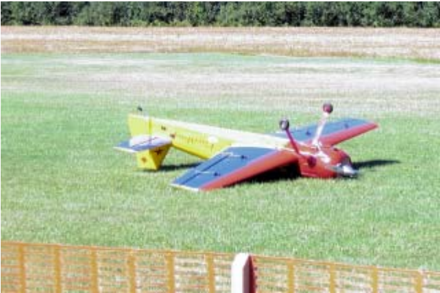
Low inverted pass...